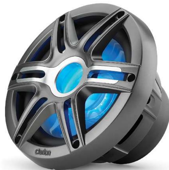
CMSP-101RGB Subwoofer shown with CMGP-101-SG Premium 10 in / 250 mm Marine Subwoofer Sport Grille in Metallic Gray finish