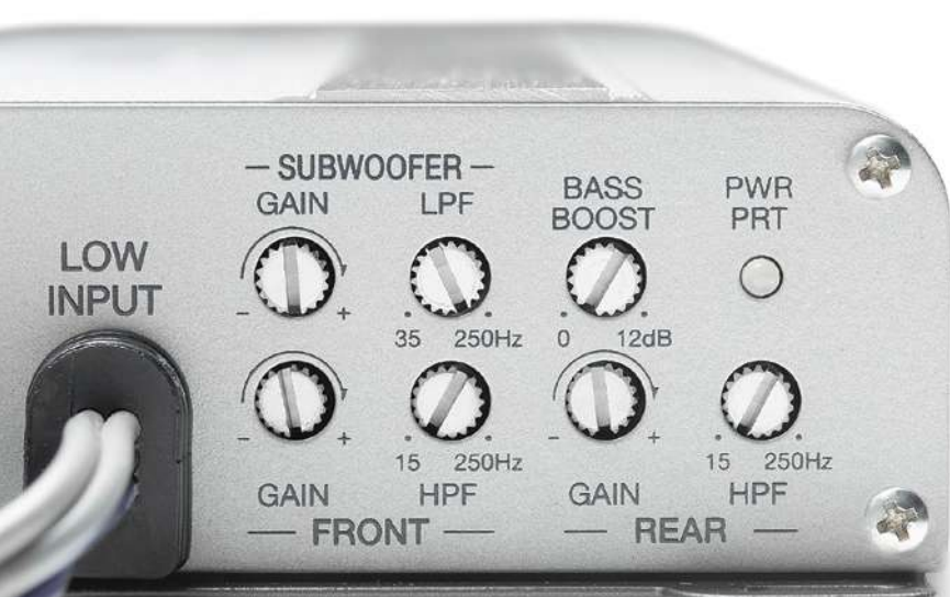
XC2510 Control Panel