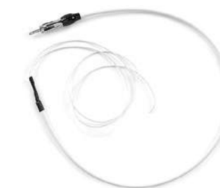
CMC-WHTANT-AM/FM Motorola Style AM/FM Antenna